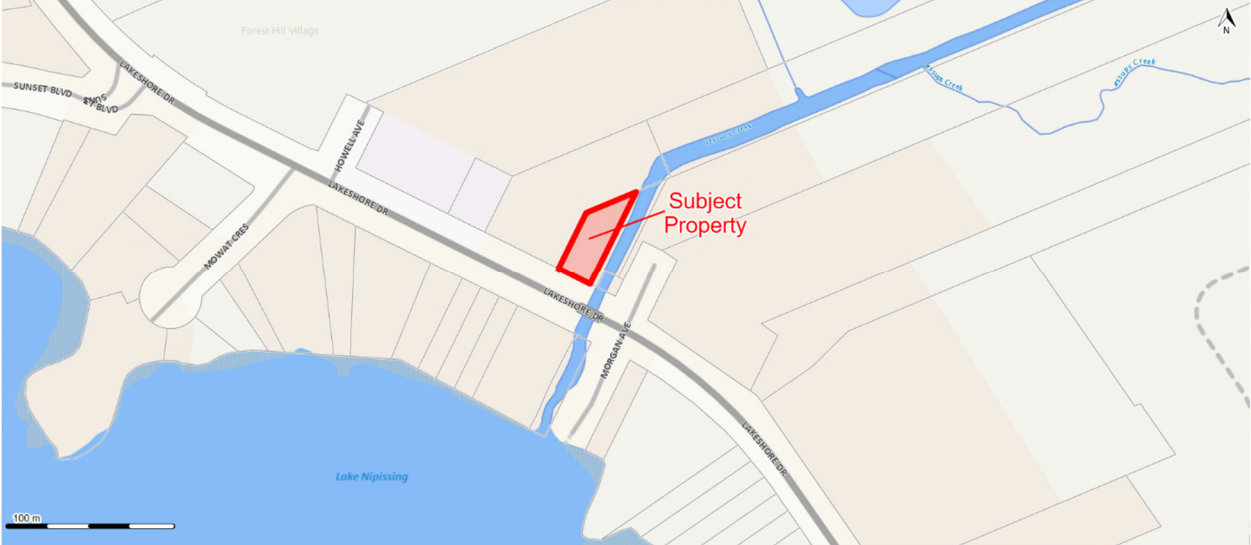
Figure 1: Map of Subject Property and Surrounding Area

The property has an existing lot area of 700 square metres (0.07 hectares) and lot frontage of 17.3 metres on Lakeshore Drive, as shown on attached Schedule B.